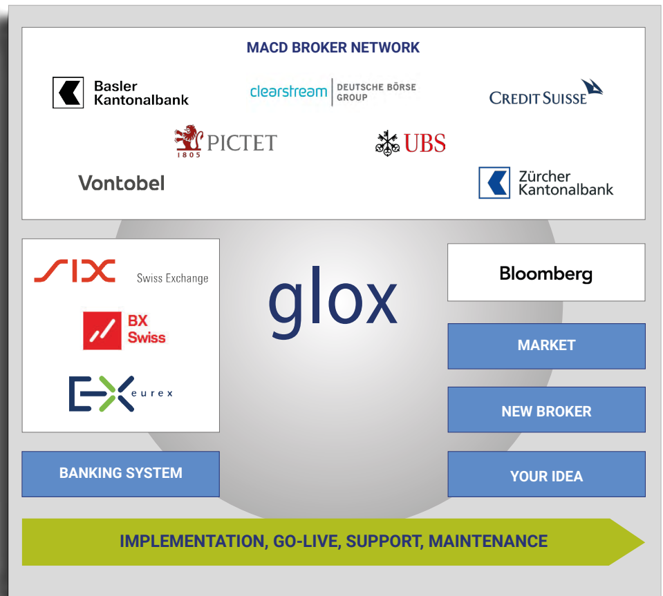
Trading System GLOX Overview

The high degree of straight-through processing which can be achieved with GLOX supports the current regulatory requirements, reduces errors, and makes trading and workflow management efficient.